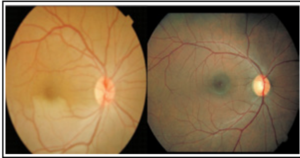
Fig.1: Fundus photograph of a patient with Hemiretinal artery occlusion, before and after YAG Embolysis.

We found out that anatomical success was seen in two eyes out of seven in Group-A, while five out of seven in Group-B. In embolysis group, the embolus was not evicted in one case. This case had multiple fibrin platelet type emboli, secondary to carcinoma breast. One of the patient in which anatomical success was not achieved had severe vitreous hemorrhage after laser embolysis refractory to resolution in three months, precluding further retinal view. The similar results of retinal reperfusion were found by researchers in a case series. 12 In another study, it was found that treated artery trunk and its branches exhibited completely restored blood flow in 38.2% of the cases, basic recovery in 32.4% of the cases, and partial recovery in 14.7% of the cases; the treatment was ineffective in five eyes (14.7%). 13 This however combined use of intravenous urokinase alongside Nd:YAG laser embolysis for management of retinal artery occlusion. Our results are in line with available data.