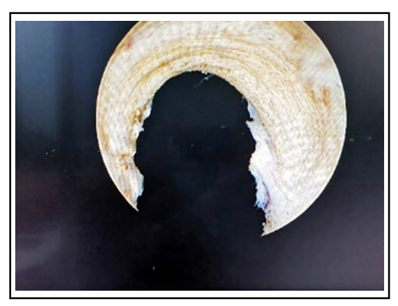
Fig.2: Annular fibers were fully exposed.