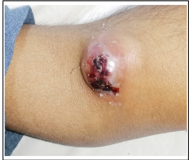
Fig.2: Pseudo aneurysm secondary to AVF.

assessment of the outcomes of interrupted technique and surgeon satisfaction is of prime importance hence the study was aimed to document the Outcomes of AV fistula formation for dialysis patients using interrupted sutures.